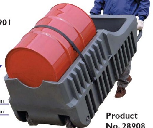
Product No. 28908